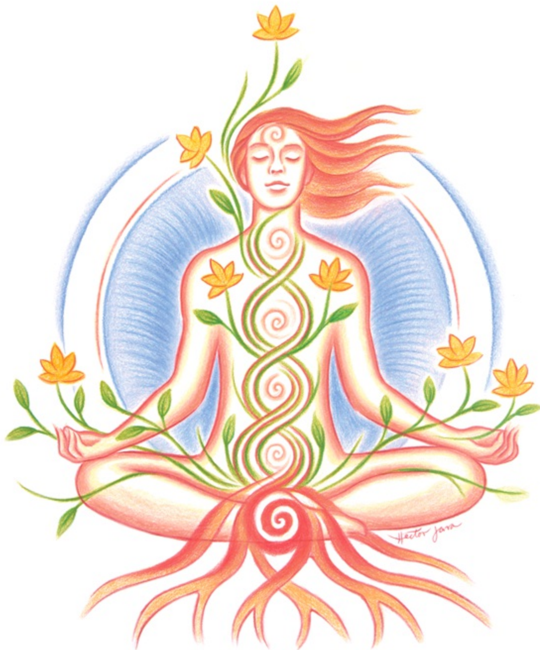
The First Chakra