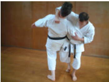
1. Outside reaping throw