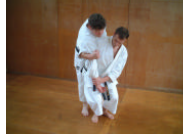
2. Shoulder Throw