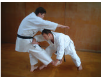
3. Leg throw