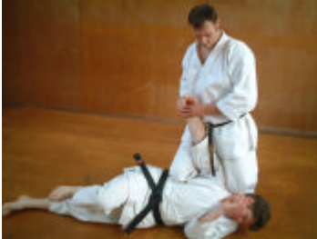
1. Straight arm Lock