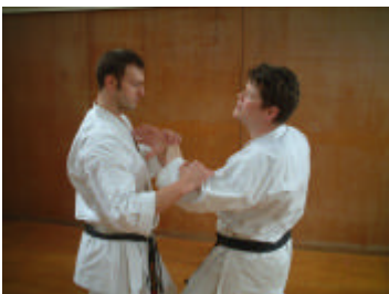
1. 'S' Lock (radius/ulna twist)