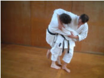
3. Sweeping hip throw