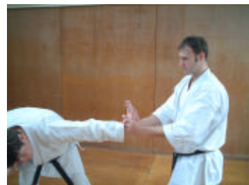
2. Two hand wrist lock