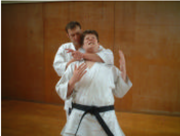
3. Rear Choke