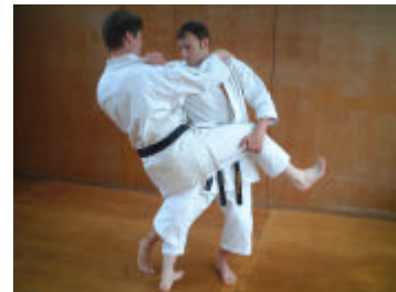
2. Inside reaping throw