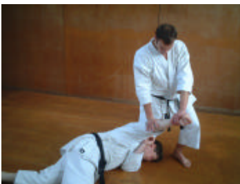
3. Cricket Bat