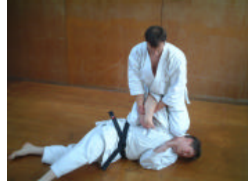
2. Wrap-up Lock