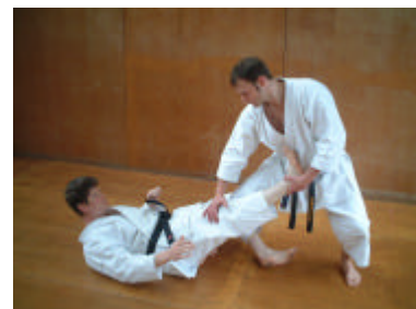
Leg throw from Kururunfa