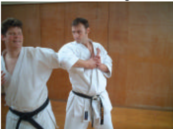
3. Chicken Wing