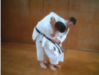
1. Hip Throw