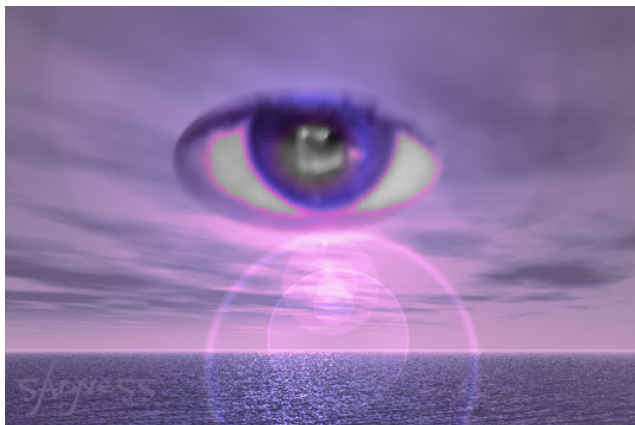
"Sadness" created by Revenant aka Slaygen

I've used this exercise to escape my body a few times. It can also induce other weird but harmless effects. Close your eyes and spend a few minutes relaxing as completely as you can and clearing your mind of all worries and idle thoughts. Then, spend a few minutes trying to decide where your consciousness is seated. Is your consciousness in the center of your head or perhaps somewhere between the eyes? Wherever it is, visualize a tiny pinpoint of light at that point. You don't have to be exact about the location. If you're not comfortable with where you have visualized the pinpoint of light, move it until you are comfortable with it. Spend a few minutes visualizing that pinpoint of light as clearly as you can. Try to shrink your awareness until you are only aware of your head. Then shrink your awareness even further, so that you can't feel anything except that pinpoint of light. Next, visualize the point of light slowly moving down toward the base of the brain, where the cerebellum is. Move it about four inches down, then slowly move it back to its original position. Repeat this visualization several times. This visualization can induce the vibrations and get you out of your body.