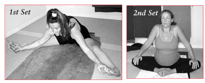
Modifications for second part of Head/Knee/Stretching Pose

25. SPINE TWISTING (HALF POSE) With leg straight out and elbow against knee.