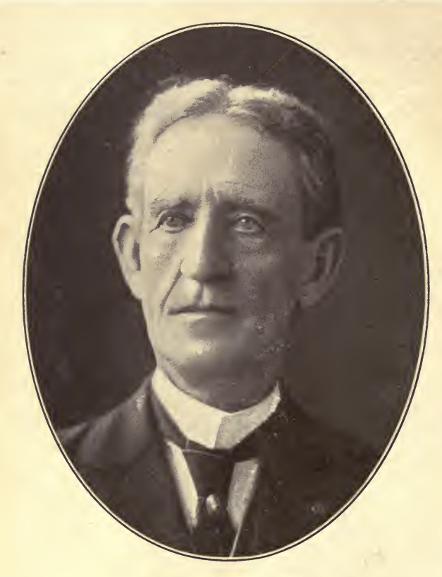
ADVENT SEPT. 7, 1845