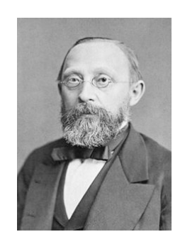
Rudolf L.K. Virchow<sup>26</sup>