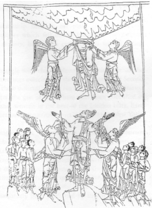
Enoch the initiate being taken up into Heaven to become Metatron the first fully realised human being. [11th Cent English]

Before the beginning there was only Absolute Nothing and Absolute All, and that in order that manifestation might come into being