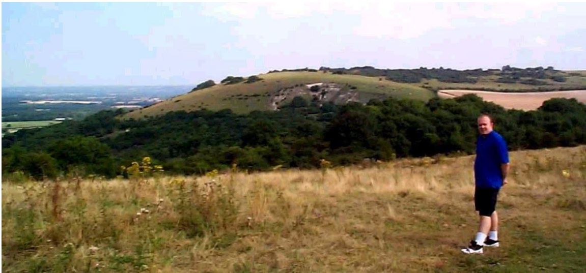
Devil's Dyke somewhere in England (UK)