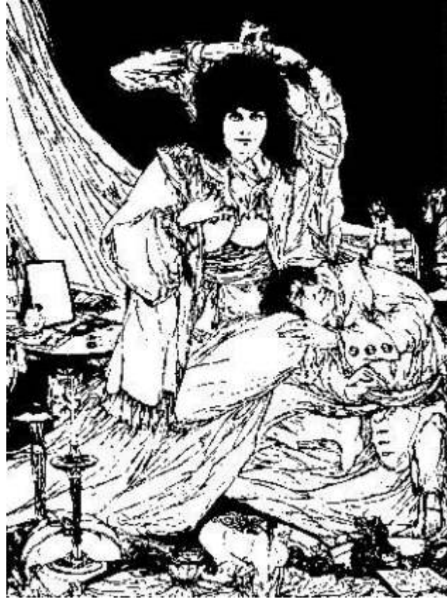
THE BEAUTY DOCTOR.