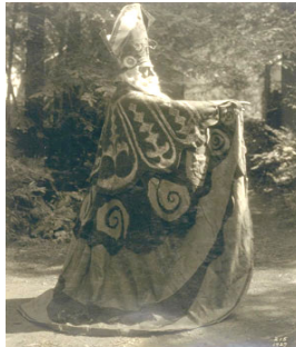
Figures 5.1 – 5.2. Photographs from Bohemian Grove.