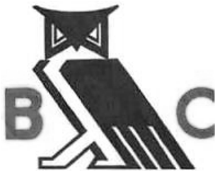
Figure 5.4. Moloch - the owl logo of the Bohemian Club.

Towering forty feet above a black altar is the main attraction of the macabre Bohemian Club – the giant stone owl called the Owl of Bohemia. As we have seen, the owl has been described as the guardian of the goddess of the underworld since ancient times. This owl – called “Moloch” - is the symbol and logo for the Bohemian Club (Figure 5.4). Moloch is the Babylonian-Cannanite deity to whom children and adults were sacrificed. Widows of former Bohemian Grove members (who most likely were not keen on their husbands’ summer camp with the boys) report that their husbands were obsessed with owls and had little owl statues all over their houses. Little wonder now why the owl appears on buildings and state capitols all over the United States and even hides on the dollar bill.