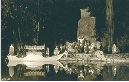
Figure 5.3 Photograph of the Cremation of Care ceremony.

Towering forty feet above a black altar is the main attraction of the macabre Bohemian Club – the giant stone owl called the Owl of Bohemia. As we have seen, the owl has been described as the guardian of the goddess of the underworld since ancient times. This owl – called “Moloch” - is the symbol and logo for the Bohemian Club (Figure 5.4). Moloch is the Babylonian-Cannanite deity to whom children and adults were sacrificed. Widows of former Bohemian Grove members (who most likely were not keen on their husbands’ summer camp with the boys) report that their husbands were obsessed with owls and had little owl statues all over their houses. Little wonder now why the owl appears on buildings and state capitols all over the United States and even hides on the dollar bill.