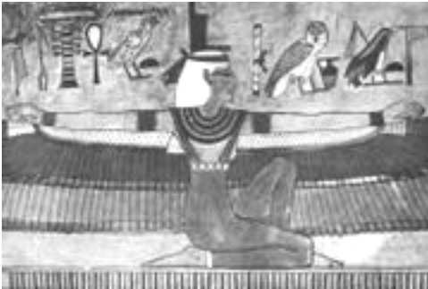
Figure 2.3: Wall painting of the goddess Isis. Circa 1360 BCE.

On the delta of the Nile, the ancient Egyptians called their goddess of the underworld Isis. In accordance with their views on the afterlife, they deemed her “Underworld Mistress of the House of Life.” The stories in the Book of the Dead speak of her as she who knows the orphan, knows the widow, seeks justice for the poor, gives shelter for the weak, the goddess of magic, and the lady of the words of power. Isis is the sister-wife of Osiris, lord of the underworld, and the mother of Horus (similar to Eris' son Horkos in the Greek myths). To the Egyptians, she was the feminine principle embodied as wife and mother and mistress of magic. Earliest depictions associate her with a throne, an ankh, eagles, vultures, and owls (figure 2.3).