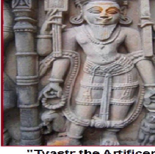
"Tvastr the Artificer