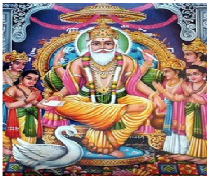
Visvakarma: The architect and worker of the Gods

"The Universe is uncaused, like a net of jewels in which each is only the reflection of all others in a fantastic interrelated harmony without end". - The Upanishad