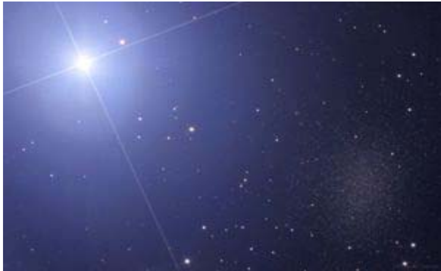
Regulas, the brightest star in the constellation of Leo

The focus is the feminine tie in. And the revolutionary signatures.