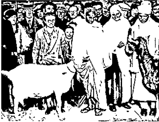
Gandhi Travelled with his Female Goat