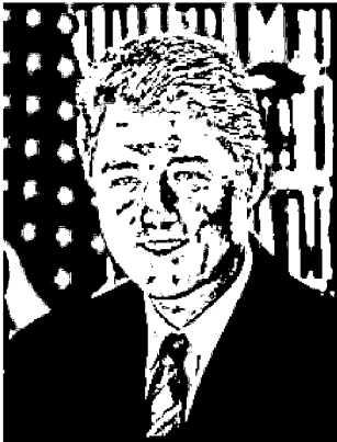
Moon in Krittika 1 st Pada

DOB: 19-Aug-1946; TOB: 07:57:00 Hrs (+6.00 west); POB: Hope, Arkansas; 93W36, 33N40