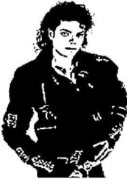
Mars is in Krillika 1 st Pada

DOB: 29-Aug-1958; TOB: 19:33:00 Hrs (+6.00 west); POB: Gary, Indiana; 87W20, 41N35