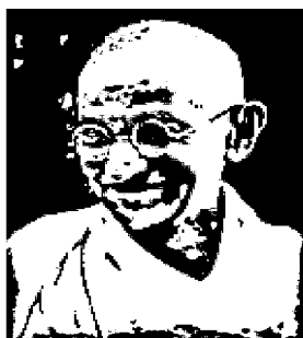
Retro Jupiter in Krittika 1 st Pada

DOB: 02-Oct-1869; TOB: 07:31:00 Hrs (+4.39 east); POB: Porbunder, India; 69E49, 21N37