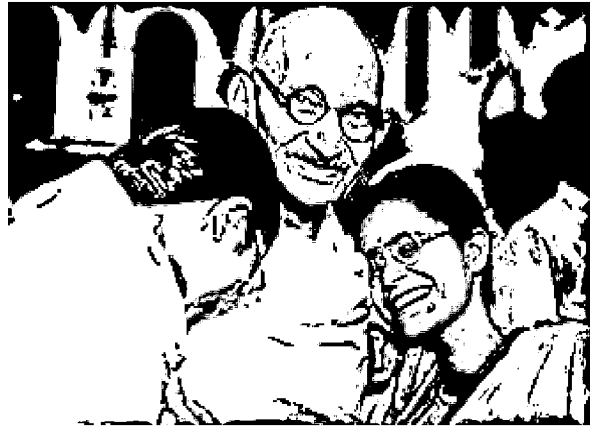
Gandhi with Abha and Manu