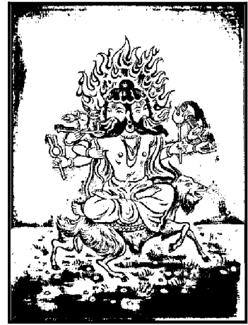
Agni Devata's Blessings